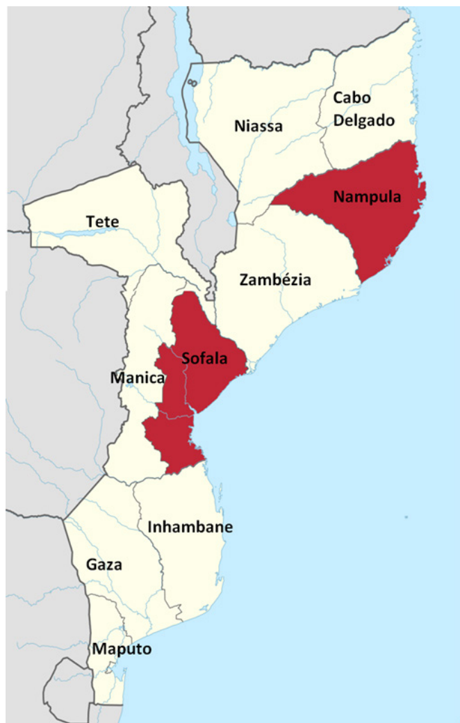
Figure 1 Trial sites.

adults surveyed report no education and 43% report primary education, while in Nampula, the corresponding figures are 36% and 41%. Nationwide in Mozambique, 35% of urban adults report no education, and 48% report primary education. Socioeconomic indicators are generally higher in Sofala, where 82% of urban adult residents surveyed report access to electricity, and around 70% report their residences have cement walls and cement floors; in Nampula, 64% of urban adults report access to electricity at home; 46% have cement floors; and 35% have cement walls. Nationwide in Mozambique, 38% report access to electricity; 40% have cement floors; and 30% have cement walls. 9